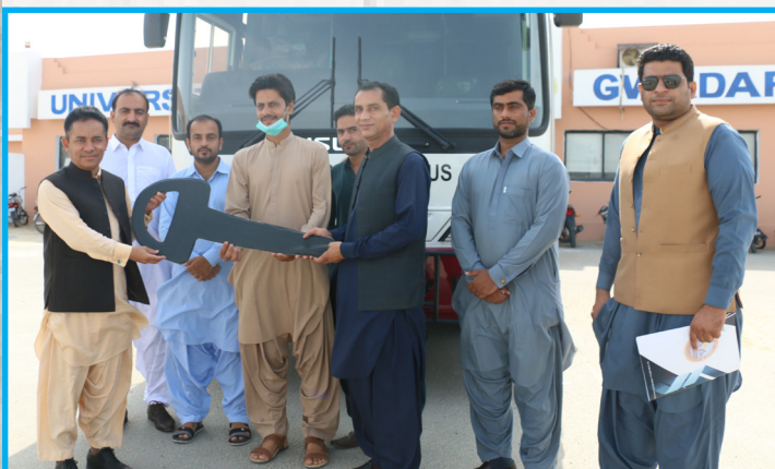
VC UoT handed over key of new bus to Gwadar Campus