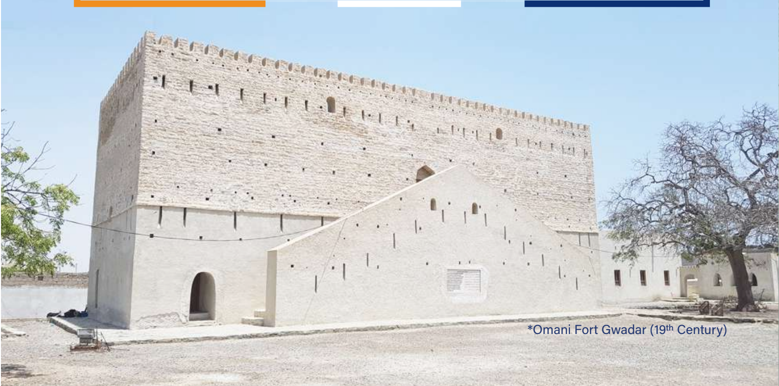
*Omani Fort Gwadar (19 th Century)

In April 2015, Pakistan and China announced their desire to build the $46 billion China-Pakistan Economic Corridor (CPEC), which is part of China's ambitious One Belt, One Road initiative. Gwadar plays an important role in the China-Pakistan Economic Corridor (CPEC), and it is also envisioned as the connection between the One Belt, One Road and Maritime Silk Road projects. As part of the China-Pakistan Economic Corridor (CPEC), $1.153 billion in infrastructure projects would be invested in the city, with the goal of connecting northern Pakistan and western China via the deep-water seaport.